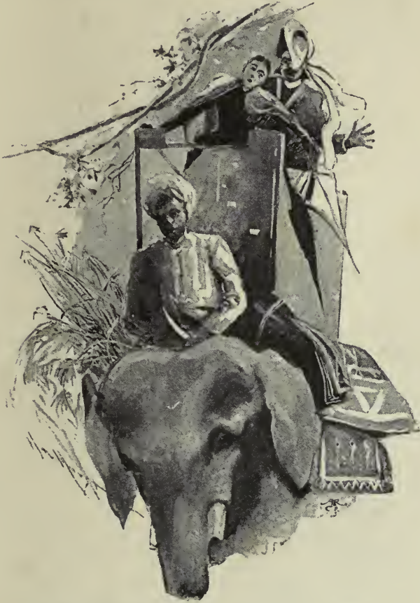
MY PITH HAT WAS KNOCKED OFF.

realised how adventurous I had been in starting. I was obliged to close my umbrella ; three times my pith hat was knocked